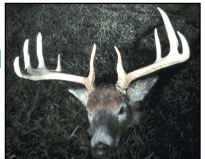
Big Buck Shot in 2011

See our upcoming auctions at www.jerrygrogg.com